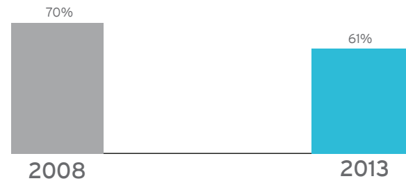
Primary Home Sales Volume

There has been a substantial fall in the sales volume of first time home buyers. In 2008, the year of great recession, primary home sales volume was down to 70%. This year, it got even lower. In 2013, the sales volume fell further to 61%. It's the lowest sales volume since the year 2005.